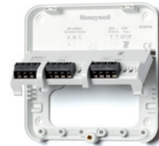
Receiver box back plate